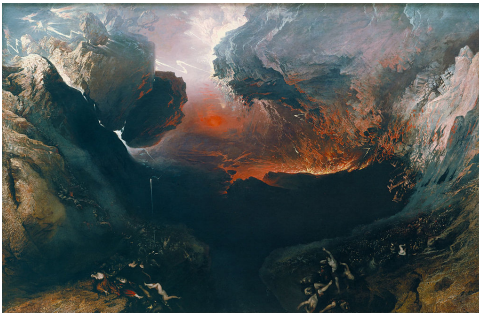
The End of the World (The Great Day of His Wrath) John Martin